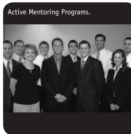
Active Mentoring Programs.