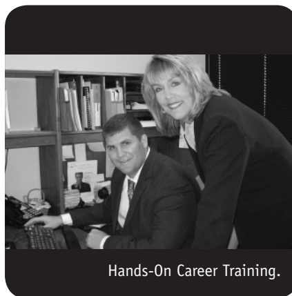
Hands-On Career Training.

Holmes Murphy's internship program will provide you with business development exposure to all aspects of the insurance industry. We offer opportunities to learn the elements of a solid sales process, the objectives of insurance carriers and the fundamentals of insurance programs. Our internship program offers an extraordinary learning opportunity and the ability to network with successful industry sales leaders.